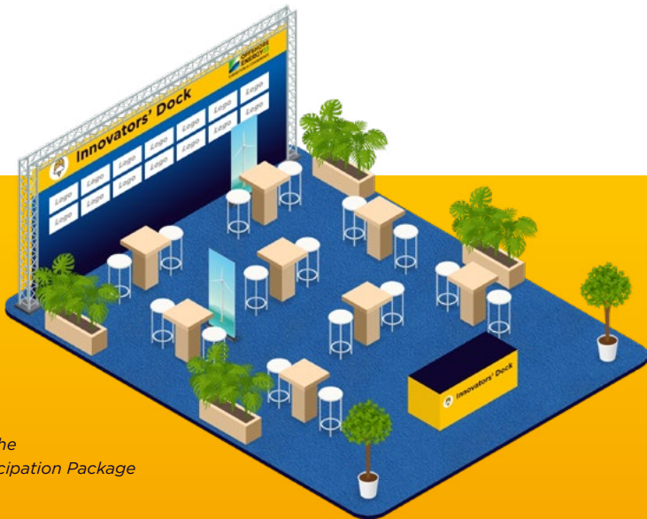
Impression of the Individual Participation Package