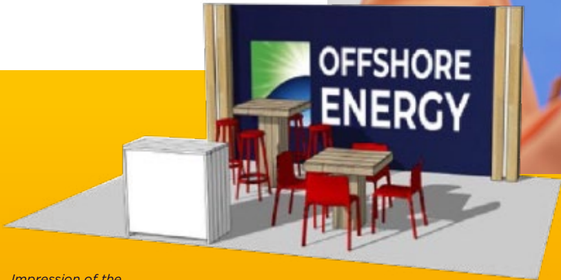
Impression of the Group Participation Package