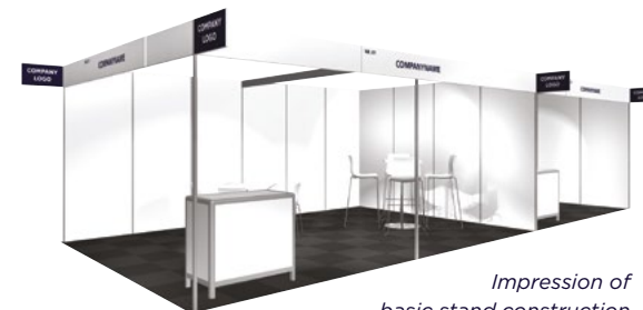
Impression of basic stand construction with furniture